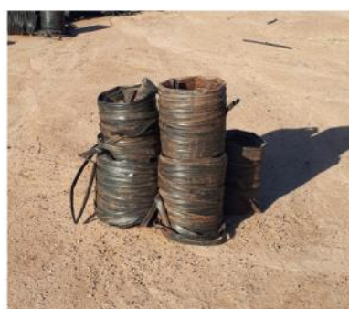
Trickle tape – clean roll