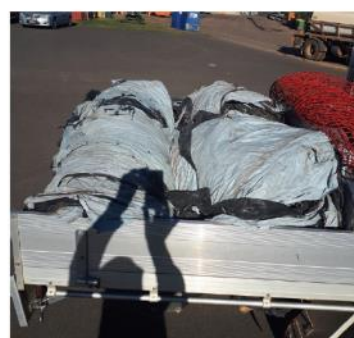
Ag plastic mulch film

Customers should be aware that loads delivered to Waste Management Facilities will be inspected and fees will be charged for loads found to be contaminated and not declared to Council Gatehouse staff at time of entry.