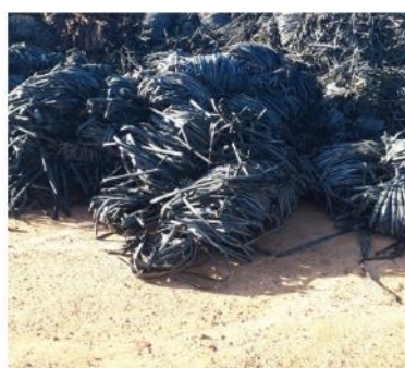
Trickle tape – clean loose