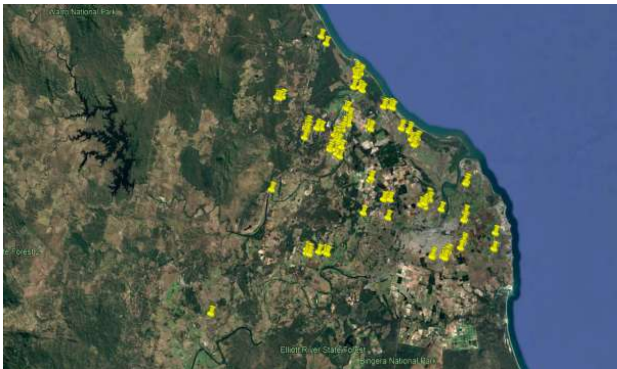
During the 2024/25 year there were 100 soil tests for 37 growers.

Growers are provided with a nutrient management plan and N & P budget when receiving the results.