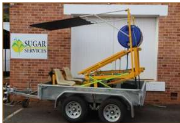
BSSL seedling planter in trailer

There have no major issues with the planter.