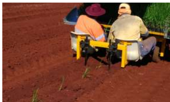
Planting one-eye setts (BSSL planter)

Growers can borrow the Bundaberg Sugar Services Seedling water wheel planter to plant their seedlings, the planter is delivered to farm and collected once they are finished using it by Sugar Services staff. Growers are taking up this offer of the seedling planter when purchasing seedlings.