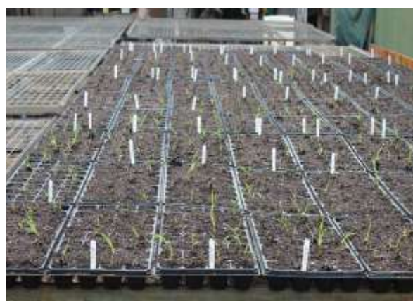
Potted One-eye Setts