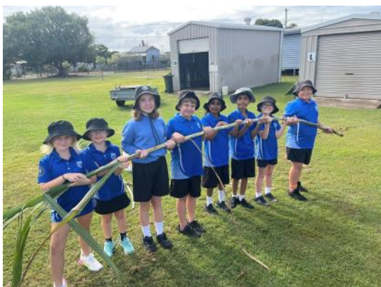
Bundaberg South School students pictured holding Sugarcane.