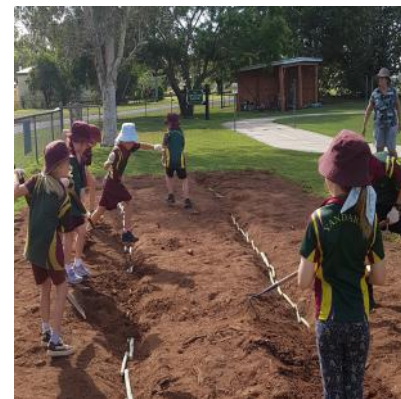
Yandaran students planting billets.