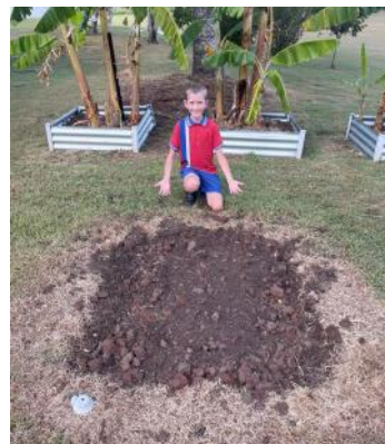
McIlwraith student viewing their freshly turned ground awaiting planting.

Follow the Sweetest School Competition - Bundaberg Region Facebook page to keep up to date with the competition. ■